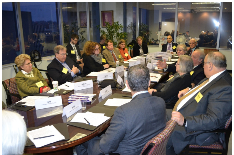
Retreat attendees talk strategy in the “situation room,” a breakout session that challenged board members to assume the perspective of a critical stakeholder in reducing preventable medical error.