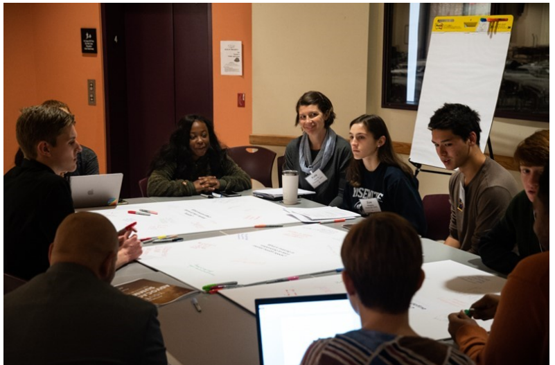
The Youth Advocacy Summit featured student-driven breakouts on building a safety net for teen mental health as well as developing policy and advocacy strategies to make it happen.