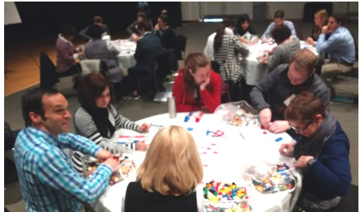
Staff at the Jewish Community Center take part in a Perfecting Patient Care SM activity designed to improve communication and workflow. The training is an example of JHF's work to improve population health by partnering with community-based organizations.

JHF approved a two-year grant of up to $500,000 to support new and ongoing training, coaching, and educational initiatives at various community organizations. These initiatives include quality improvement training and coaching for frontline providers and administrative staff at the JCC and the Jewish Association on Aging (JAA), as well as region-wide offerings related to strengthening the skills of community health workers, creating dementia-friendly organizations, and improving end-of-life care and communication. The Foundation will explore partnerships with LIFE (Living Independence for the Elderly) programs, Area Agencies on Aging, AARP, and Familylinks, among other organizations.