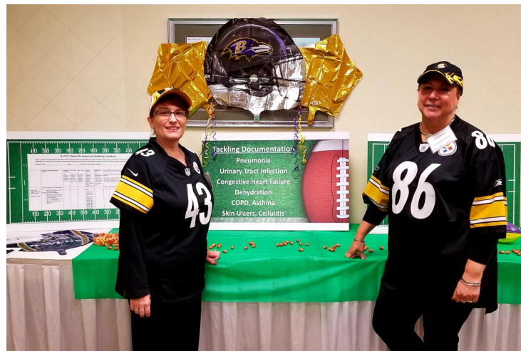
During an education leadership event in Harrisburg, RAVEN partners showcase their game plan for tackling documentation of changes in a resident's condition.

The scope of RAVEN expanded during its second phase, with new skilled nursing facilities from across Pennsylvania joining the initiative and piloting a new payment model for treating residents who have health conditions that frequently lead to hospitalizations (including pneumonia, dehydration, congestive heart failure, urinary tract infection, skin ulcers/cellulitis, and COPD/asthma). JHF continues to provide training, coaching, and education to skilled nursing facilities that have participated in RAVEN since its launch, while also providing virtual education opportunities (through Tomorrow's HealthCare™ ) to facilities in Eastern PA that joined the initiative during phase two.