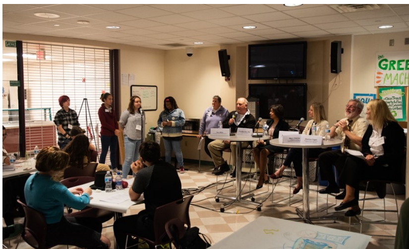
Youth present their ideas to improve teen mental health services and supports to a panel of leaders in government, human services, behavioral health care, and education.