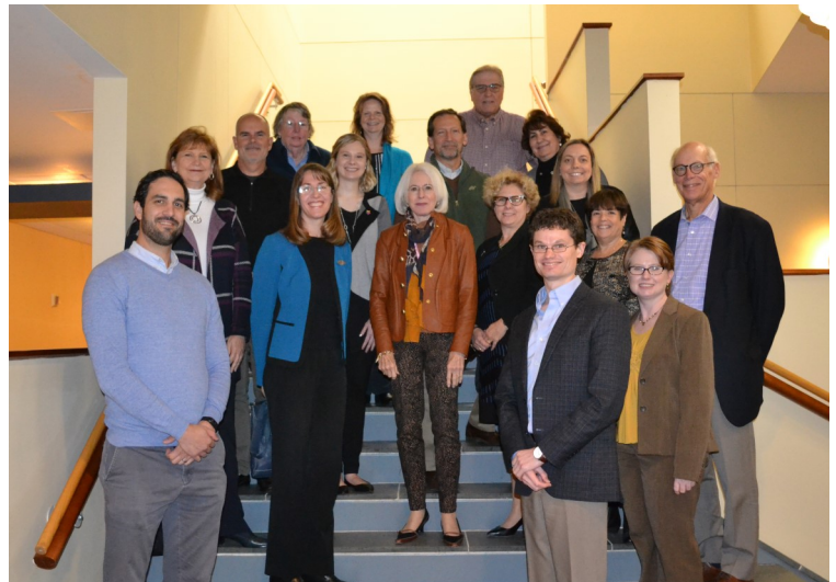
Representatives of the Pennsylvania Health Funders Collaborative, a statewide alliance that works at the intersection of health philanthropy and policy.

On November 7-8, PHFC members traveled to State College, PA for an annual meeting that focused on identifying partnership opportunities to address urgent public health challenges, promoting civility and responding to community trauma, and shaping a policy agenda in a post-midterm election landscape.