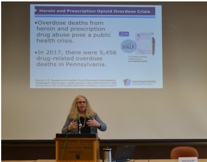
Pennsylvania Department of Health Secretary Rachel Levine, MD, describes the DOH's strategies to address the opioid crisis.