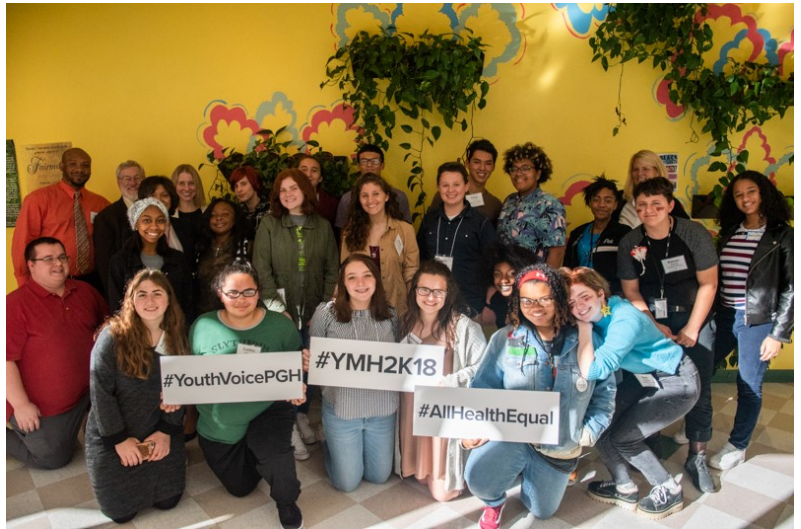
During the Youth Advocacy Summit, more than 30 high school students shared their concerns and aspirations related to teen mental health.

During the day, youth advocates discussed the impact of community trauma on mental health, societal pressures to be perfect, and the role of traditional and social media on how they view themselves and the world around them. Many youth stressed the need to de-stigmatize mental health matters; expand mental health training for youth-serving adults and teens; create positive messages about mental health that build resilience and coping skills; eliminate disparities in school resources; and design services and supports that account for the wide-spread and long-lasting effects of community trauma.