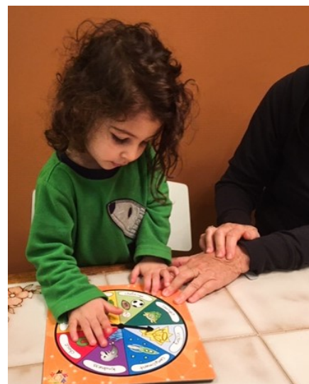
Let's talk: A Family Spinner in use at the home of a Community Day School family.

Introducing the Family Spinner to parents, they write: "Do you ever wish that your child told you the really interesting, important things they're thinking about and doing? Would you like to improve their problem-solving skills and social competence? We have a gift for you to make that happen."