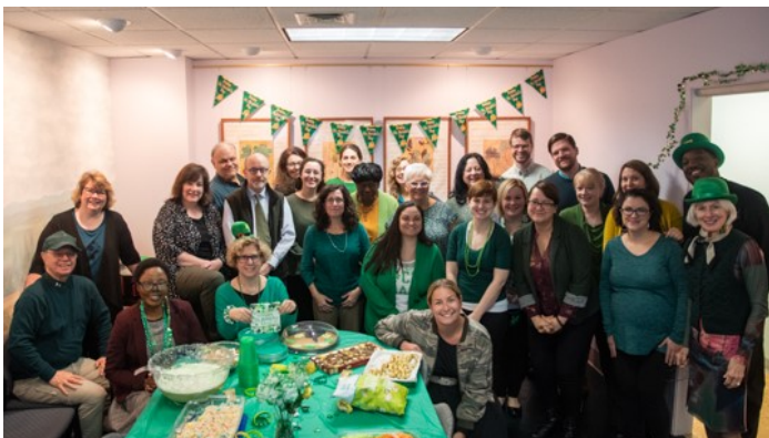
St. Patrick's Day never goes unobserved at the Jewish Healthcare Foundation. The staff gathered in green on March 18.