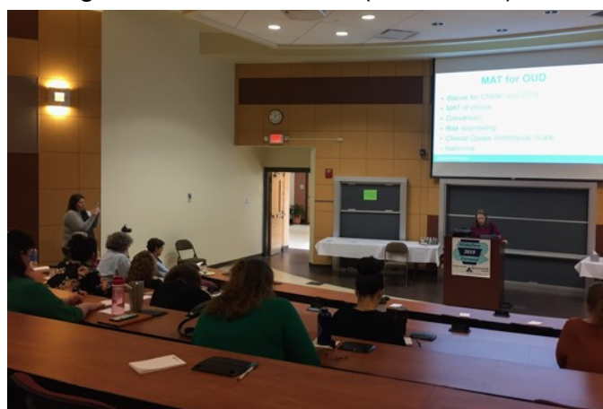
At Midwifery Forward, the first meeting of the American College of Nurse Midwives Pennsylvania Affiliate.

Read more about the conference on the WHAMglobal website: whamglobal.org .