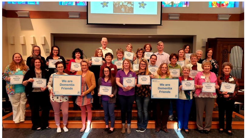
Some of the 100 new Dementia Friends and 50 new Dementia Champions in York and Adams County trained in March.